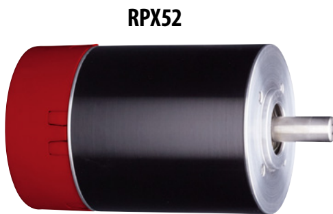
RPX52 1,650mNm Peak Torque with 435mNm of continuous torque and 130W of power at 2,900RPM